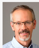
Sky Blue, MD

Infectious Disease Medicine, Sawtooth Epidemiology and Infectious Disease